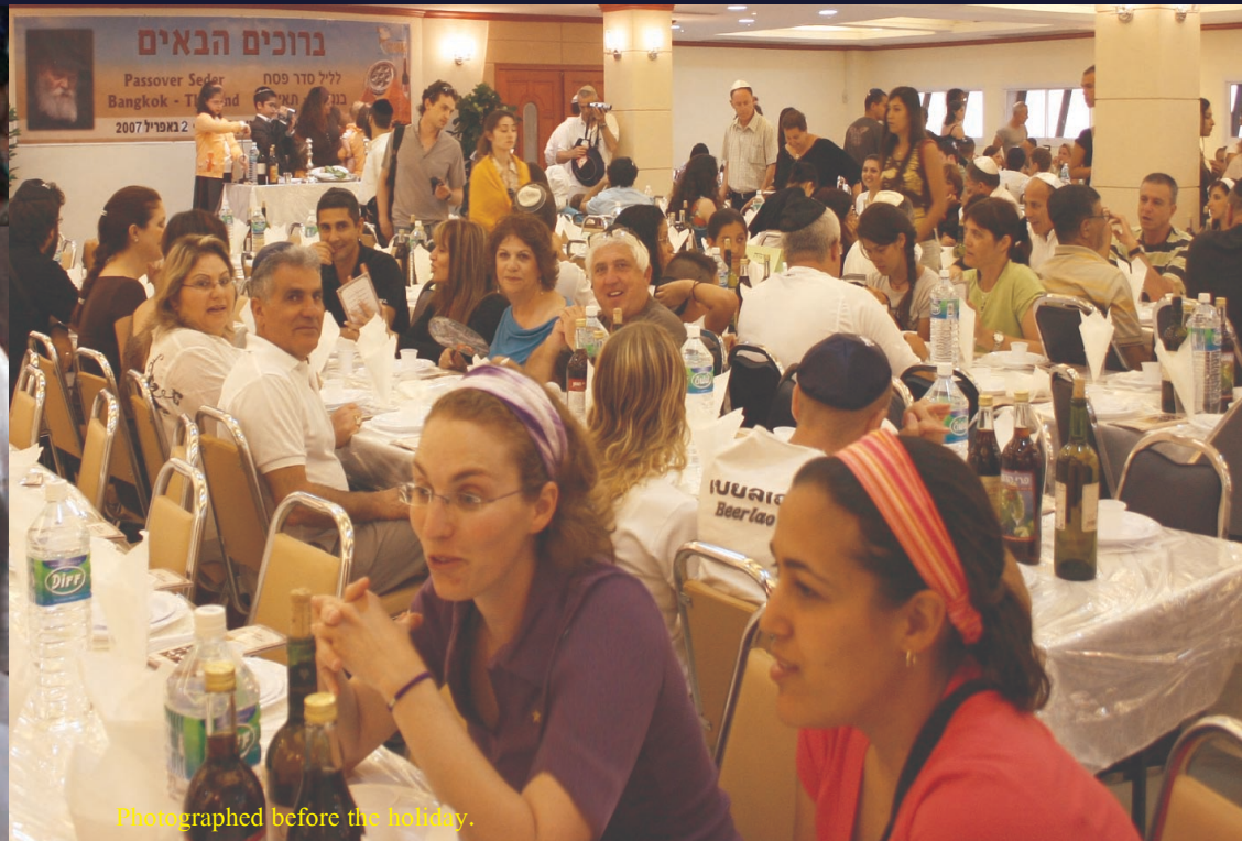
Photographed before the holiday.

Thousands of guests come to celebrate the Jewish holidays with us. Rosh Hashana and Yom Kippur are especially well attended as they usually coincide with the height of the tourist season in Thailand.